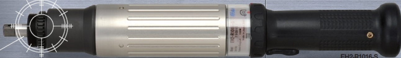
EH2-R1016-S ※Full scale