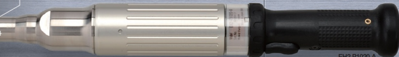
EH2-R1020-A ※Full scale