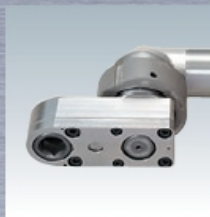
○ Crow foot gear